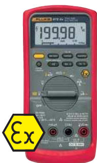
Fluke 87V Ex