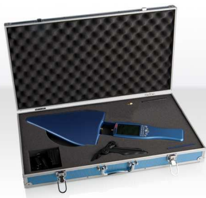
The included Transportcase

With this functionality, you can even discover sporadic EMC problems which would otherwise be very hard to detect. Even though SPECTRAN® units "only" last 2 to 3 (depending on model) hours with one battery charge, the intelligent "Powerdown mode" enables much longer data logging and measurement timespans. Finally, if this is not enough, the external power supply can be used to extend the recording timespan infinitely.