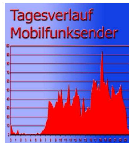
Daily variation of this RF transmitter discloses EXTREME variation in time

Thanks to its DIRECT frequency display of the individual signal sources, a doubtless mapping of measurement results to the corresponding radiation sources is possible.