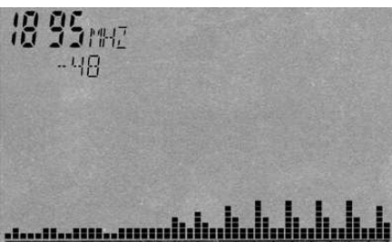
Well visible: "Frequency hopping" of a DECT portable phone between 1890 and 1900 MHz (Screenshot)