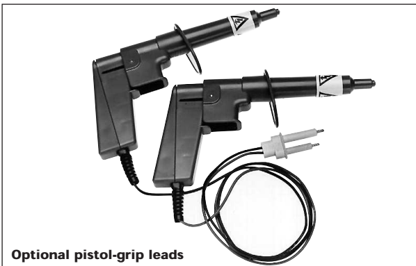
Optional pistol-grip leads