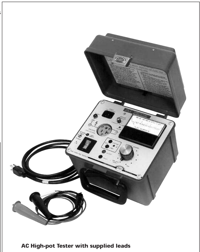
AC High-pot Tester with supplied leads