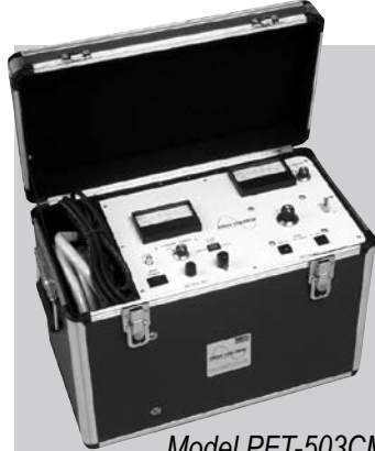
Model PFT-503CM (0-50 kVac)

0-10 kVac, 0-30 kVac, 0-50 kVac and 0-100 kVac