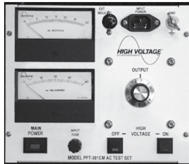
PFT-301CM Control Layout

Note: For 230 volt line input, an F is suffixed to the model number.