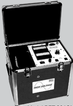
Model PFT-301CM (0-30 kVac)