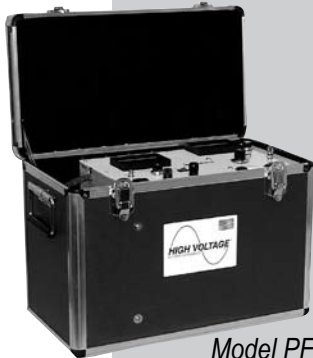
Model PFT-1003CM (0-100 kVac)