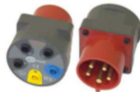
Three-phase socket adapter 16 A / 32 A