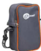
Carrying case M13 (only MPI-540-PV) WAFUTM13