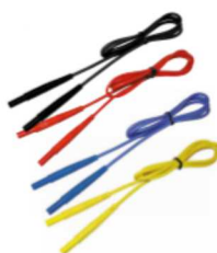
Test lead 1,2 m (banana plugs) black / red / blue / yellow WAPRZ1X2BLBB WAPRZ1X2REBB WAPRZ1X2BUBB WAPRZ1X2YEBB