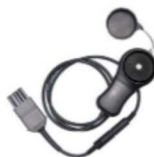
LP-10B light meter probe with WS-06 plug

only WS-06 adapter with miniDIN-4P socket WAADAWS06