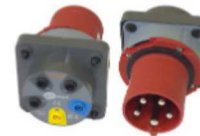
Three-phase socket adapter 63 A