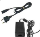
Charging Mains cable with IEC C7 plug WAPRZLAD230 Z7 power supply WAZASZ7