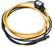
F-1A flexible clamp (Ø 360 mm)