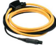
F-2A flexible clamp (Ø 235 mm)