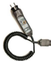
WS-03 adapter with START button with UNI-Schuko plug (CAT III 300 V) WAADAWS03