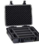
Hard carrying case for clamps