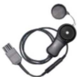
LP-10A light meter probe with WS-06 plug