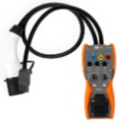
EVSE-01 adapter for testing vehicle charging stations