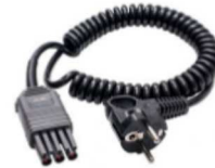
WS-04 adapter with UNI-SCHUKO angular plug