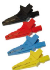
Crocodile clip 1 kV 20 A black / red / blue / yellow WAKROBL20K01 WAKRORE20K02 WAKROBU20K02 WAKROYE20K02