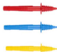
Pin probe 1 kV (banana socket) red / blue / yellow WASONREOGB1 WASONBUOGB1 WASONYEOGB1