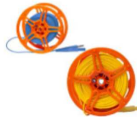
Test lead for earth resistance measurement 25 m / 50 m